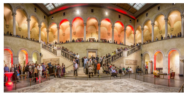
WORCESTER ART MUSEUM